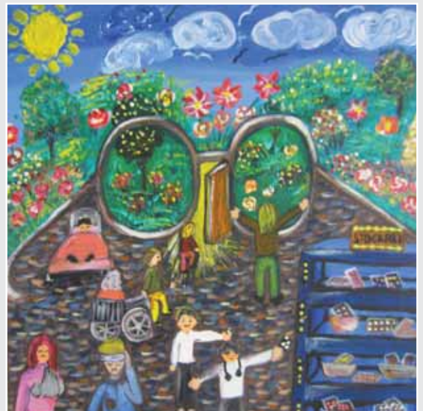
Name Surname Selin Coşan - Conscious Medication Consumption School Öğretmen Ufuk Özdemir Ortaokulu Class - No 7D - 39