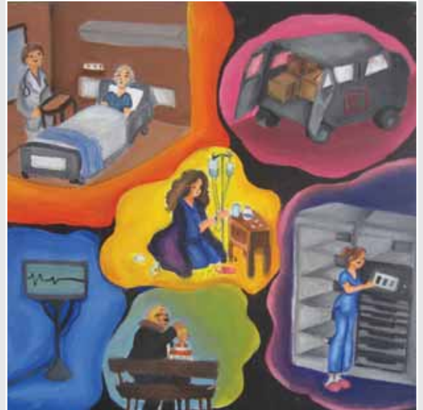
Name Surname Ecrin Burakgazi - The Story of the Medication School Remzi Doğan Ortaokulu Class - No 7A - 349