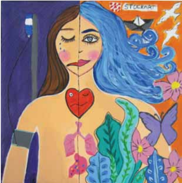
Name Surname Zehra Bulut - Choose Your Side School Mustafa Kemal Paşa Ortaokulu Class - No 8C - 628