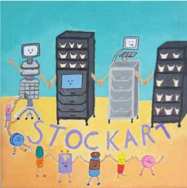
Name Surname Ecrin Arslan - Stockart Smart Medication Systems School Nevvar Salih İşgören Ortaokulu Class - No 6A - 579