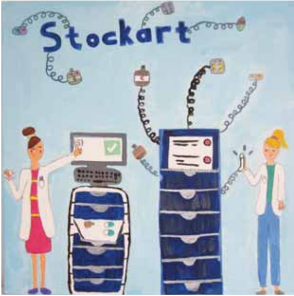
Name Surname Aişe Zümra Aydın - Stockart Smart Medication Systems School Nevvar Salih İşgören Ortaokulu Class - No 5A - 59