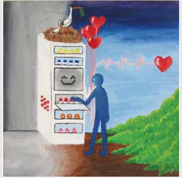
Name Surname Şirin Yılmaz - Health Rhythm with Automation School Şehit Dursun Acar Ortaokulu Class - No 7B - 552