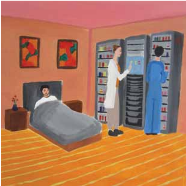
Name Surname Gülin Nur Sarı - Medication and Time School Gazi Umurbey Ortaokulu Class - No 7B - 371