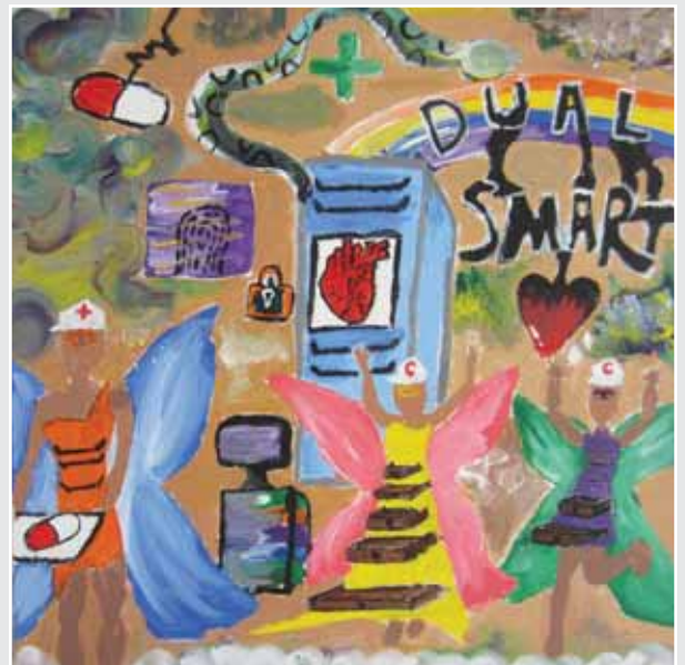
Name Surname Kaan Gölgekaya - The Power of the Butterflies School Dedeoğlu Ortaokulu Class - No 7A - 126