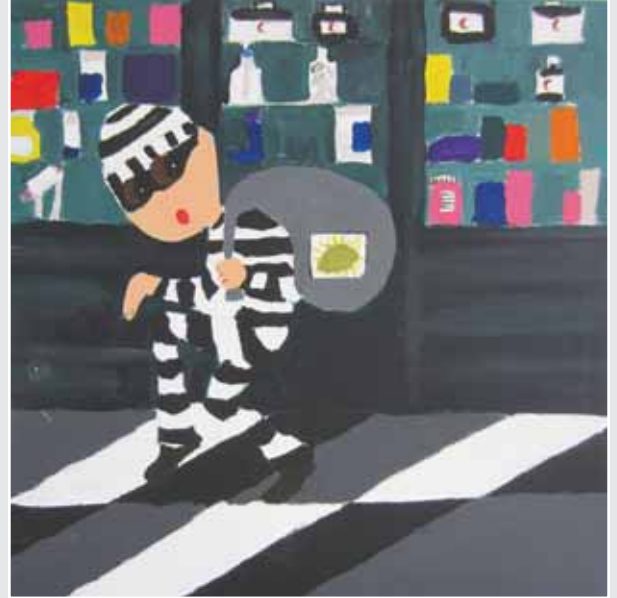
Name Surname İrem Nur Özel - Smart Medication Usage and Automation School Gaziemir İmam Hatip Ortaokulu Class - No 8A - 40