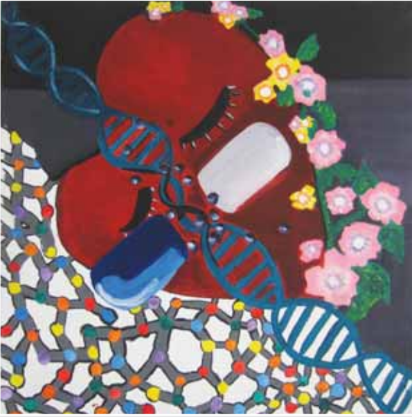
Name Surname Sudenur İsbir - Smart Medication Usage and Automation School Gaziemir İmam Hatip Ortaokulu Class - No 7A - 53