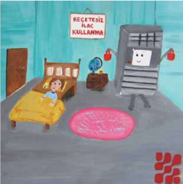
Name Surname Masal Su Altındağ - A Short Visit School Atatürk Ortaokulu Class - No 6H - 1995