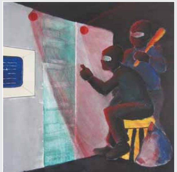
Name Surname Doruk Ceylan - Reliability School Atatürk Ortaokulu Class - No 8B - 1108