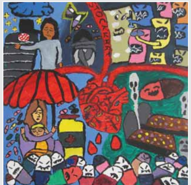
Name Surname Melek Ceyhan - Conscious Medication Use School Sarnıç Şehit Uzman Çavuş Egemen Yıldız Ortaokulu Class - No 7A - 274