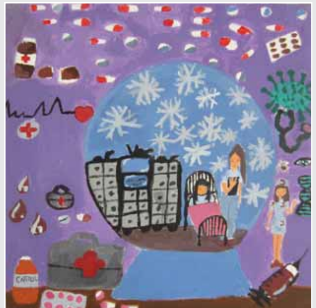
Name Surname Yağmur İter - The Hospital in the Sphere School Dedeoğlu Ortaokulu Class - No 6A - 356