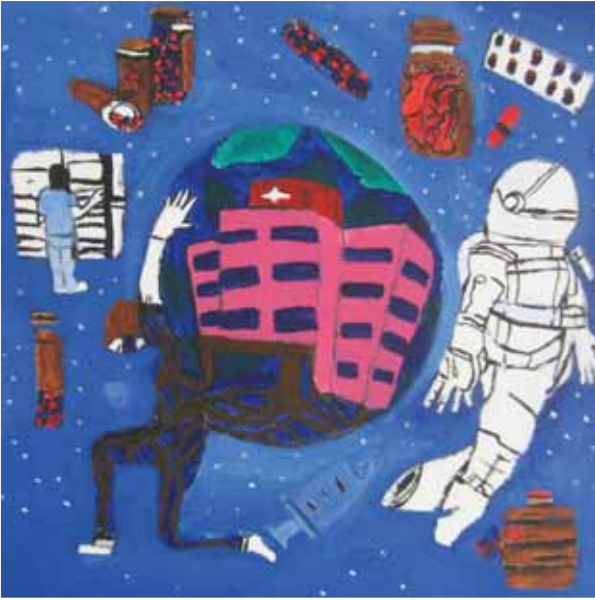
Name Surname Nazlı Adıgüzel - Life in Space School Aslanlar Ortaokulu Class - No 8A - 72