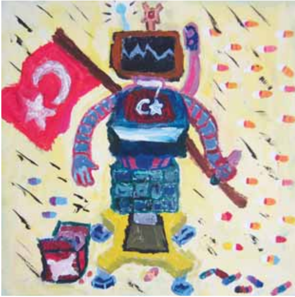
Name Surname Umut Kaan Yıldız - Hero Robot Osmangazi School Aslanlar Ortaokulu Class - No 6B - 100