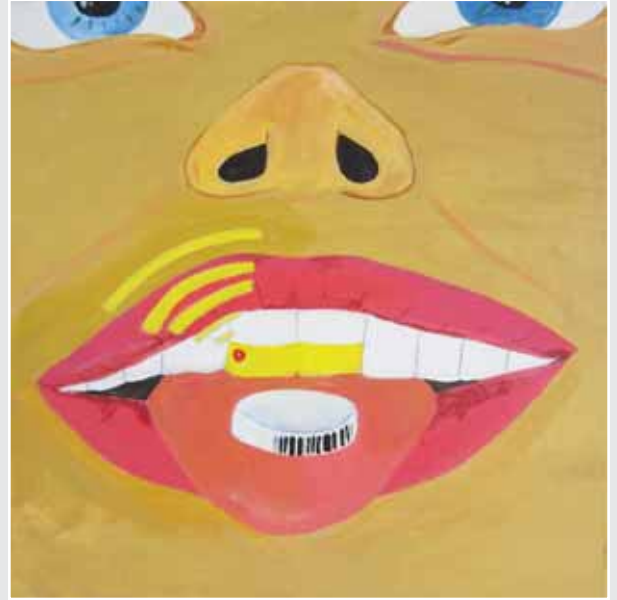
Name Surname Zeynep Kılıç - Medication-Controlled Tooth School İzmir Ticaret Odası Ortaokulu Class - No 6A - 58