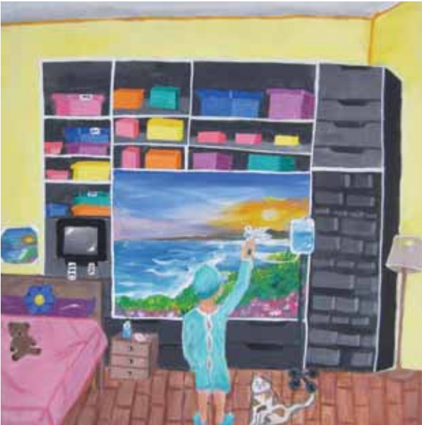
Name Surname Sıdıka Irmak Yüksel - My Dream Is Coming True School 9 Eylül Ortaokulu Class - No 7C - 276