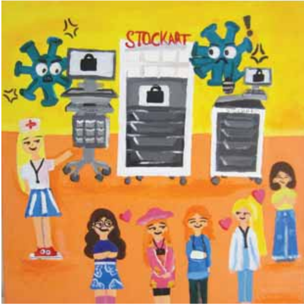
Name Surname Betül Ceren Uygur - Smart Device Usage School Nevvar Salih İşgören Ortaokulu Class - No 6B - 107