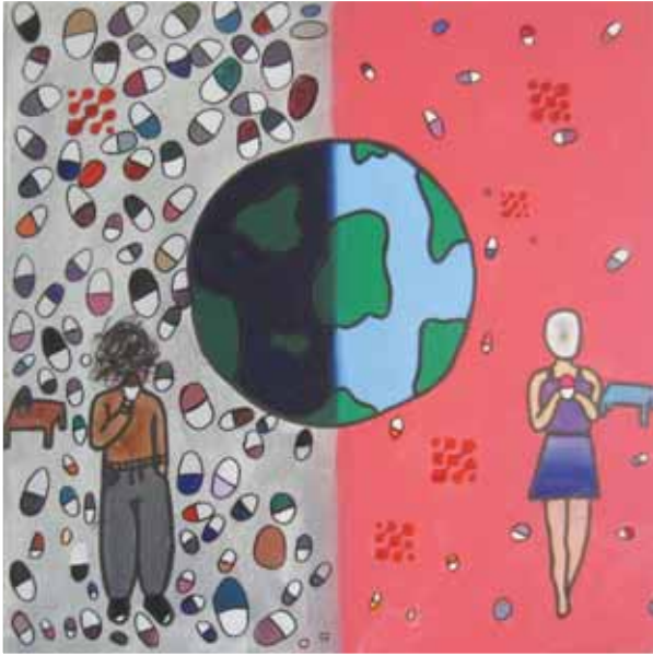
Name Surname Eylül Su Özer - Tablet Usage School Mustafa Kemal Paşa Ortaokulu Class - No 7A - 49