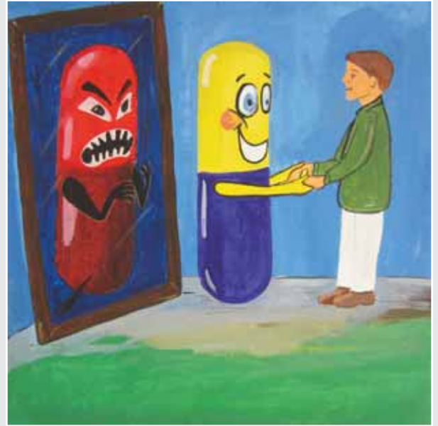
Name Surname Umut Gerek - The Other Side of Medication School İzmir Ticaret Odası Ortaokulu Class - No 7B - 278