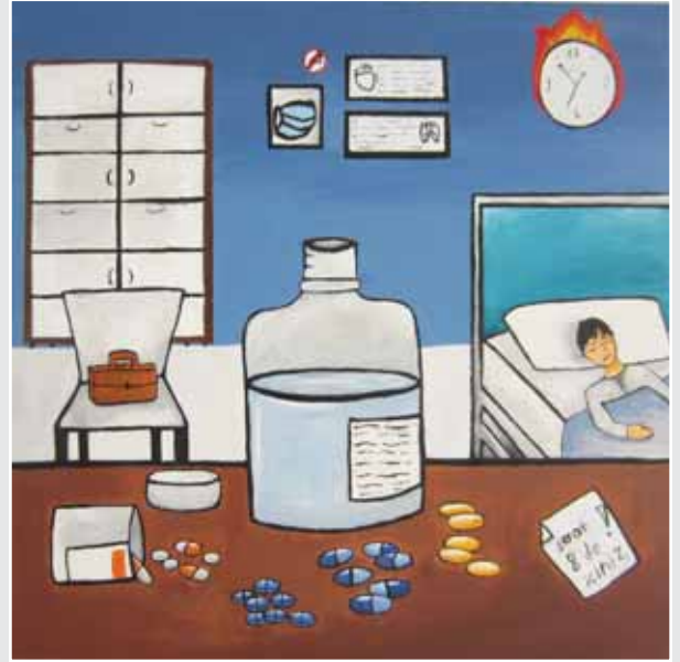
Name Surname Maral Nurlyyeva - Use Medications Correctly for Health School Şehit Uğur Palancı Ortaokulu Class - No 7E - 57