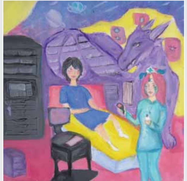
Name Surname Sudenaz Yavuz - The Power of the Dragon School Dedeoğlu Ortaokulu Class - No 7C - 165