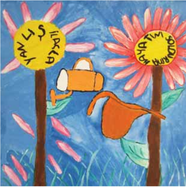
Name Surname Kardelen Bilgiç - Smart Medication Usage and Automation School Gazemir İmam Hatip Ortaokulu Class - No 8A - 25