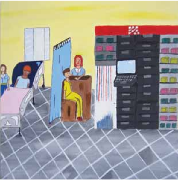
Name Surname Uğur Metin - Full-Time Medication School Gazi Umurbey Ortaokulu Class - No 8B - 310