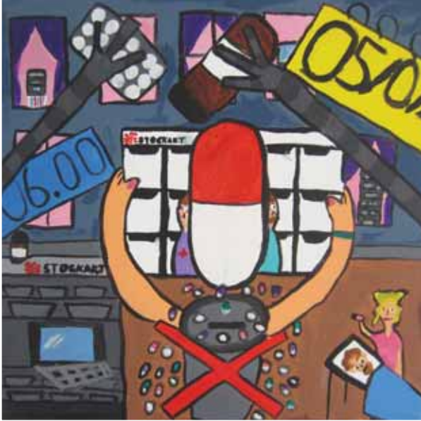
Name Surname İpek Onuk - Right Time Right Medication School Gazi Umurbey Ortaokulu Class - No 6F - 265