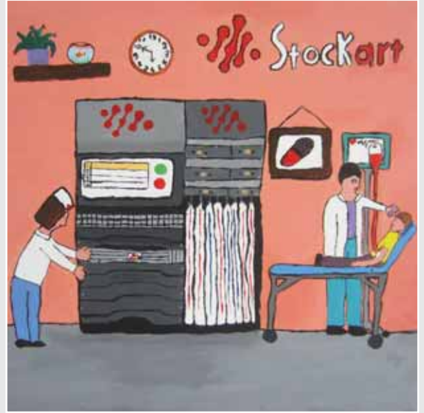
Name Surname İlkin Kapkın - Let's Use Medications Wisely School Gazi Umurbey Ortaokulu Class - No 6F - 555