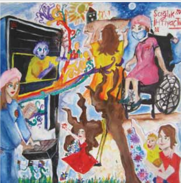
Name Surname Işık İlke Zengin - Smart Medication Usage School Şehit Dursun Acar Ortaokulu Class - No 8A - 390