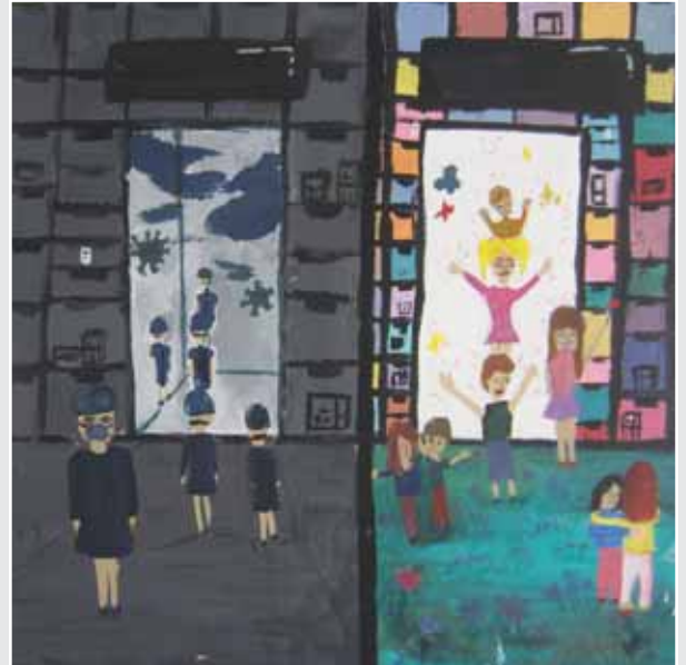
Name Surname Zeynep Zengin - Welcome Life School 9 Eylül Ortaokulu Class - No 6B - 345