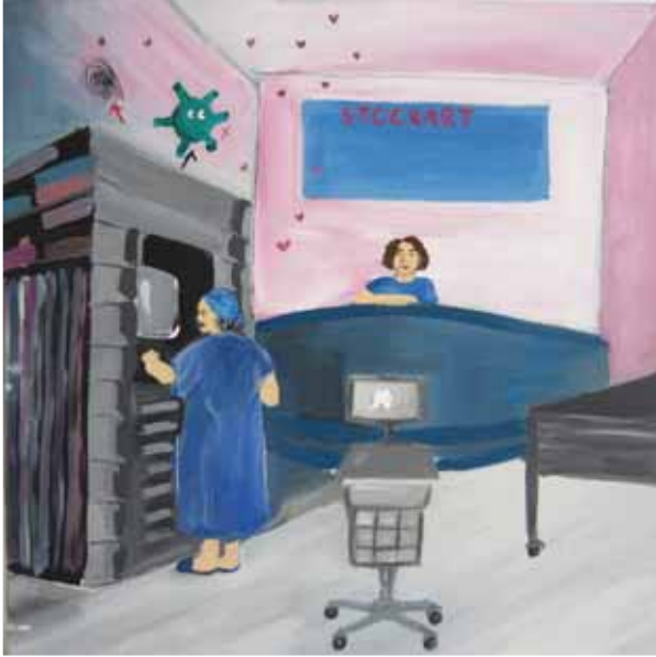
Name Surname Cemile Ada Kılıç - Stockart Smart Medication Systems School Nevvar Salih İşgören Ortaokulu Class - No 8A - 269