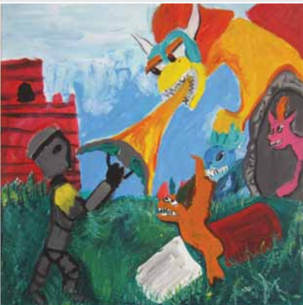
Name Surname Efe Hasan Oğuz - Smart Medication Usage and Automation School Gazemir İmam Hatip Ortaokulu Class - No 5A - 17