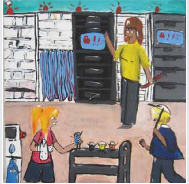
Name Surname Ece Ceren Erdoğan - Stockart Smart Medication Systems School Nevvar Salih İşgören Ortaokulu Class - No 6C - 394