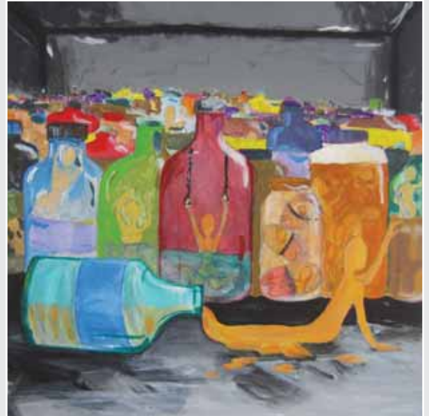
Name Surname Melis Aydınarslan - Captives of Medications School İzmir Ticaret Odası Ortaokulu Class - No 6B - 127